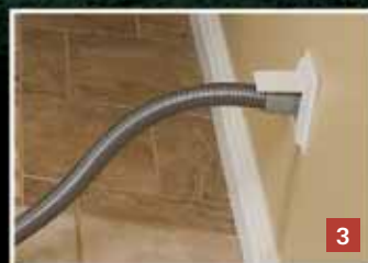
The vacuum inlets are strategically placed.