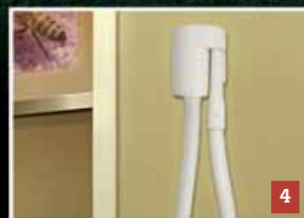
The WallyFlex : the ideal tool for a quick clean.