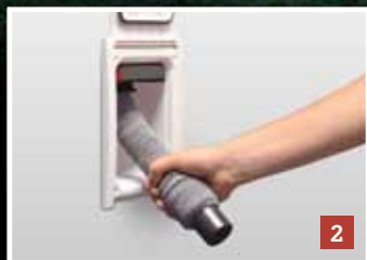
What's handier than a flexible hose that automatically stores itself?