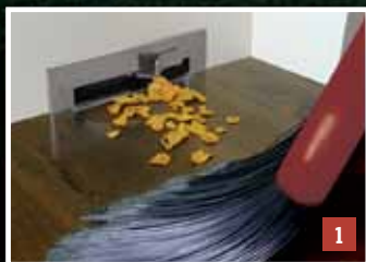
The automatic dustpan is a must for the kitchen.