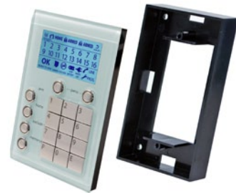
Surface mount backbox for mounting on hard surfaces Part No. 106-133 Sold separately.